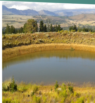
Prevents water loss