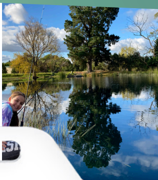
Polishes water surface