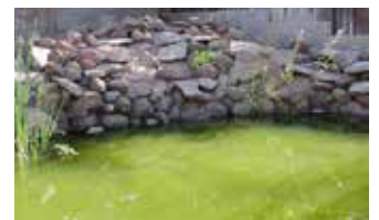
All the benefits of barley straw without the mess!

water all year round. Aquatic Barley Straw Extract instantly gives results letting you enjoy the benefits of natural barley straw. No need to wait when you are using Aquatic Barley Straw Extract, it will naturally improve water purity. Perfectly safe to use around fish, plants and people.